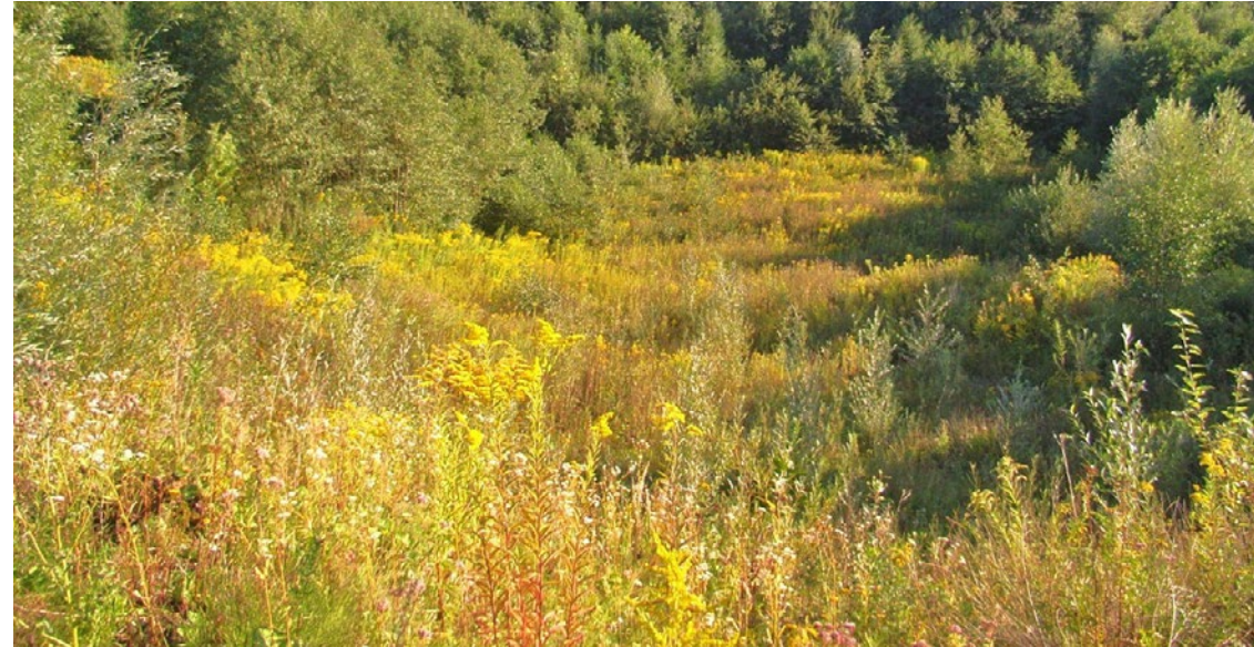
Creation of ‚Wilderness areas in the front yard‘ (Project: Dynamic islands within the cultural landscape)