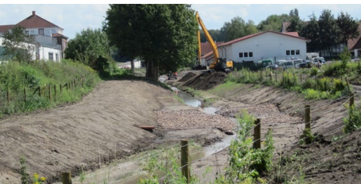
Construction site of the Lippeverband – Building the Climate Corridor Kamen Baustelle

reached amongst citizens. In addition, experiences from other cities in implementing nature-based projects could be integrated into the planning and implementation processes. With a budget of about €1.4 million, the project achieved not only a long-term and cost-effective adaptation of the local water infrastructure, but also created notable benefits for the targeted habitats and a general improvement in the attractiveness and utility of the area for residents. The project was supported by the EU INTERREG IV B NWE programme.