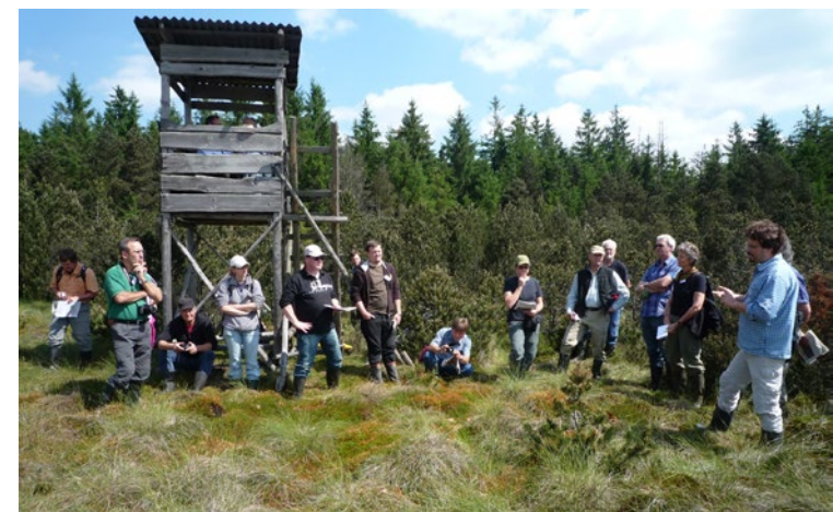
Tour of the project area to develop a regional peatland development concept (ReMoKo-Project)

Ecosystems can effectively mitigate climate change.