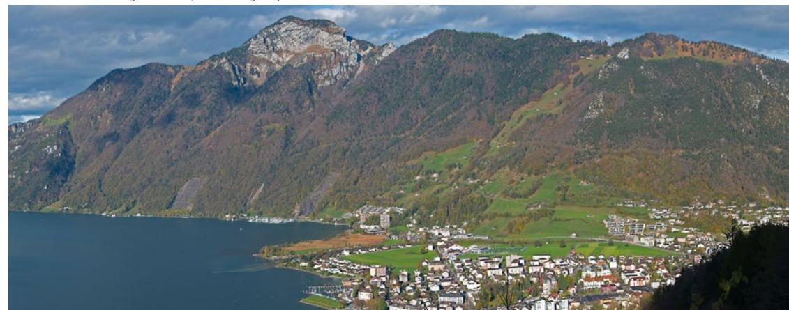
Urmiberg Panorama, Oberallmig Project

Responsible actor: Oberallmeindkorporation Schwyz