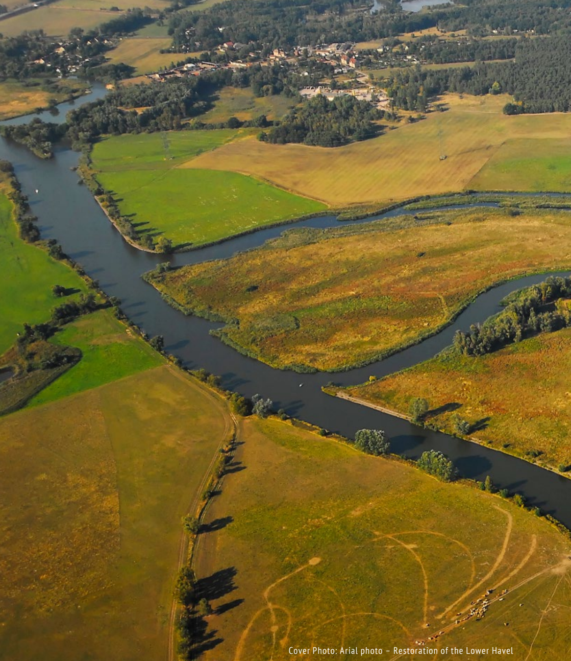
Cover Photo: Arial photo – Restoration of the Lower Havel