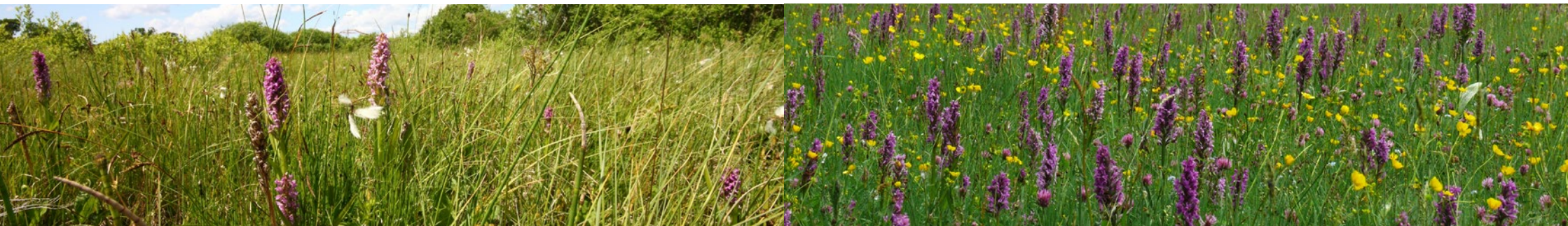
Protection and restoration of alkaline fens in Brandenburg (LIFE+ Project)