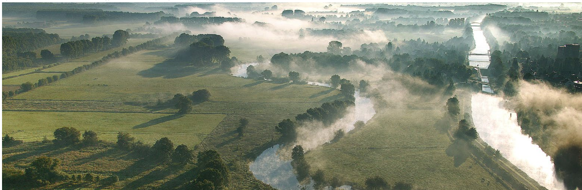
Optimization of the connection between the Lippe River and its floodplain (LIFE+ Project „Lippeaue“)

The diversity of relevant actors demonstrates not only the need for a cross-sectoral approach, but also offers opportunities for new forms of cooperation and financing, eg. in the form of public-private partnerships.