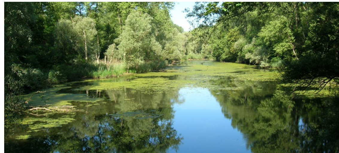
Restoration of semi-natural meadows with extensive floodplains – „Russheimer Altrhein“ (LIFE project area „Rheinauen bei Karlsruhe“)