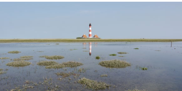
In Westerhaver, a salt marsh is created due to the natural sediment dynamics and grows slowly upwards over time

The projects that fall under the umbrella of “Growing with the Sea“ aim to protect the Wadden Sea from destruction by sea level rise and thereby to protect the integrity of this world heritage site in its entirety. With this goal in mind, WWF has initiated projects, case studies, and pilot measures. The stated goal can only be achieved in cooperation with coastal protection, since measures must be sought that combine the protection of human settlements from storm surges with the conservation of the Wadden Sea; only in this way can the Wadden Sea (with its mud flats and salt marshes) “grow with” the rising sea level. To this end, the natural sediment dynamic is preserved and supported. By creating synergies between coastal protection concerns and nature conservation, the necessary measures become more cost-efficient and more sustainable.